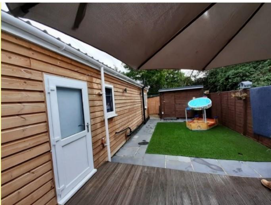
Figure 3 - Rear garden view towards Bowenhurst Lane.

The rectangular area to the rear of the dwelling is laid out as an outdoor amenity area measuring 52sqm. The separation distance between the rear elevation of the building and the 1.5m high timber boundary fence to the rear is 4.85m. The outdoor space is screened by mature trees along the boundary with Bowenhurst Lane (on a higher ground level).