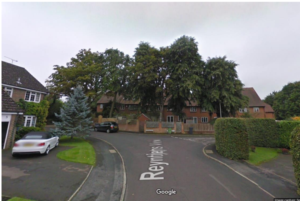
Google Streetview screen capture showing Mildmay Court trees in 2010