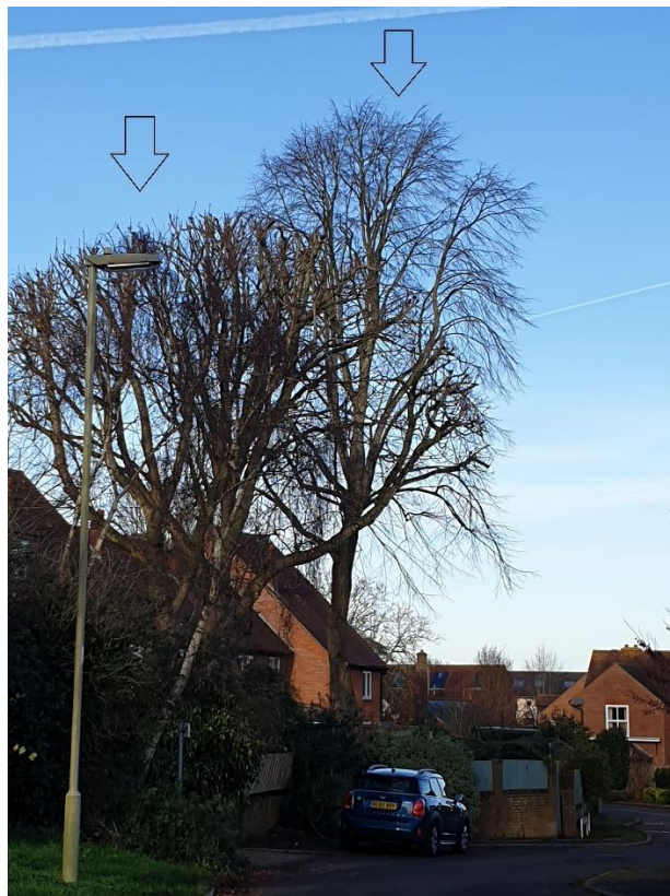
View from south from opposite 7 Reyntiens View (chestnut on left, lime on right)