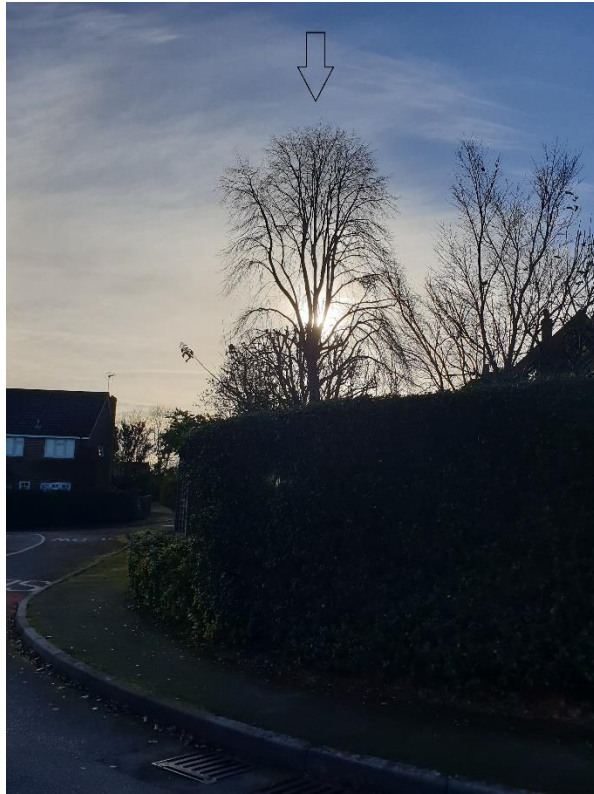
Lime viewed from north (by Seymour Place)