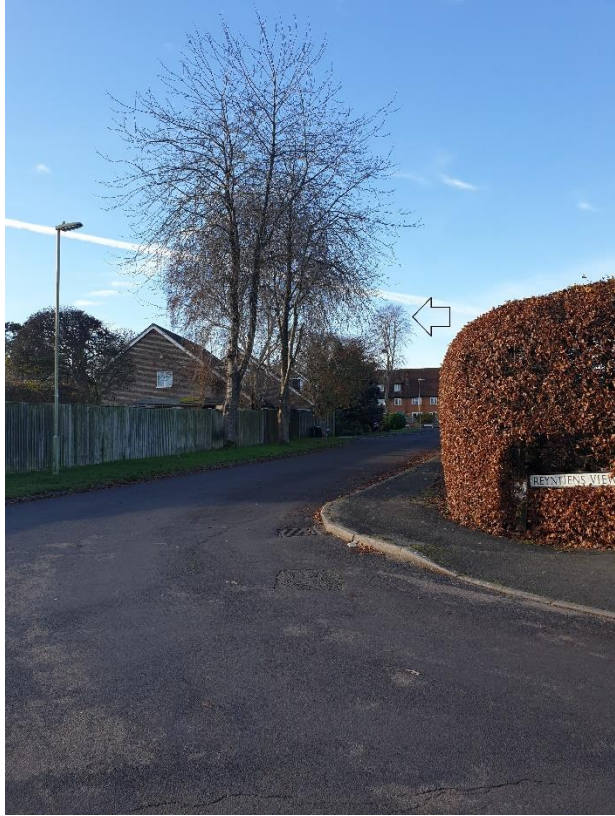
Distant view from Archery Fields (only lime visible)