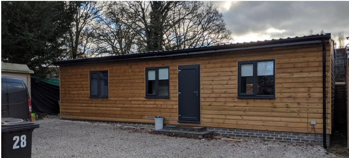
Figure 2- Existing building on site.

Therefore, no consideration/weight can be given to the uninhabitable building removed. As a result of the demolition of the former building on site, there is no lawful residential use on the land. The background that led to the removal of the unit is not a material planning consideration and cannot be given any weight in the determination of this case either.