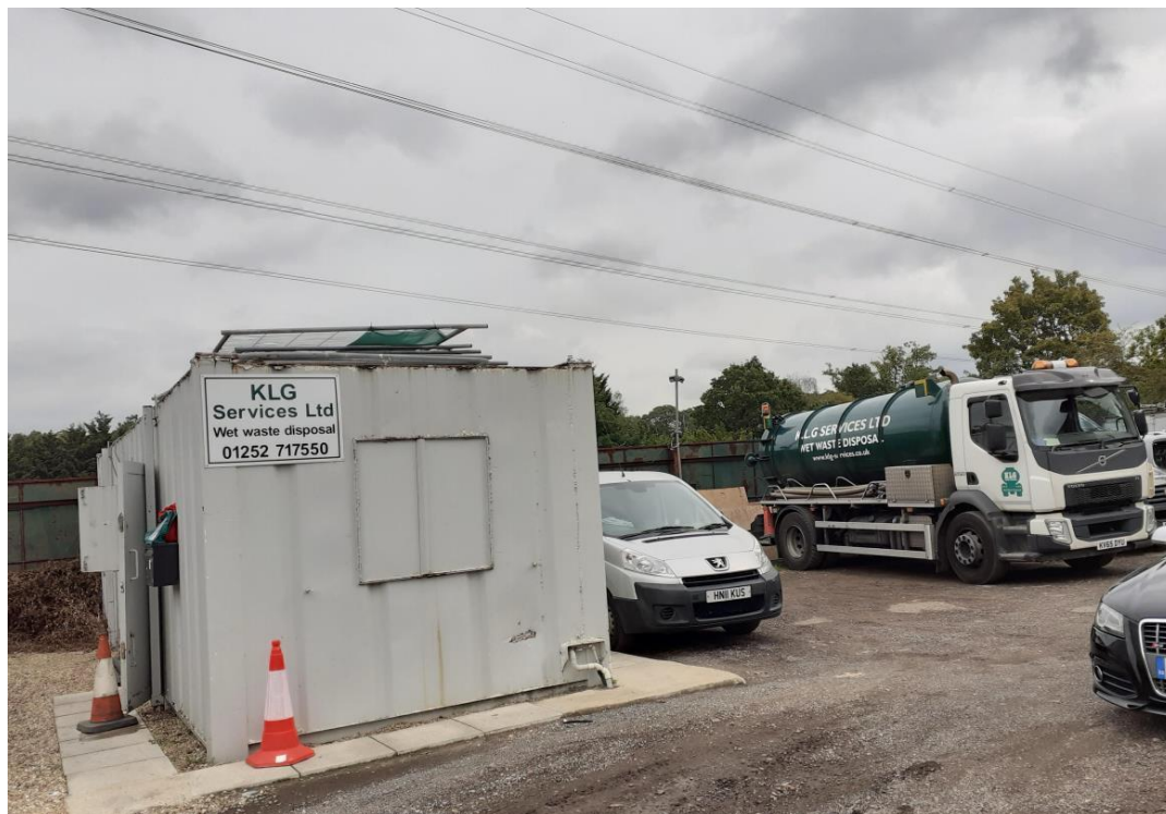
Figure 6 - Waste disposal business adjoining the subject site.

In terms of noise issues arising by the location of commercial operations adjoining the site to the South, in summary, the Environmental Health Officer (EHO) has raised an objection to the information submitted on the following grounds: