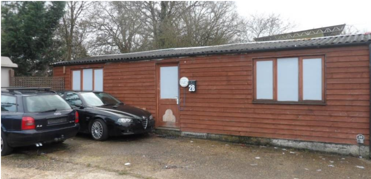
Figure 1 -Subject building May 2016

The photograph shows the state of the business unit just prior to its conversion, depicting a worn timber structure building with bitumen roof sheets (uninsulated walls 10 cm in thickness - according to the Noise Report submitted). The submitted Planning Statement at page 7 shows a photograph similar to the above and a second photograph showing the building with similar roofing but the timber cladding and window frames painted.