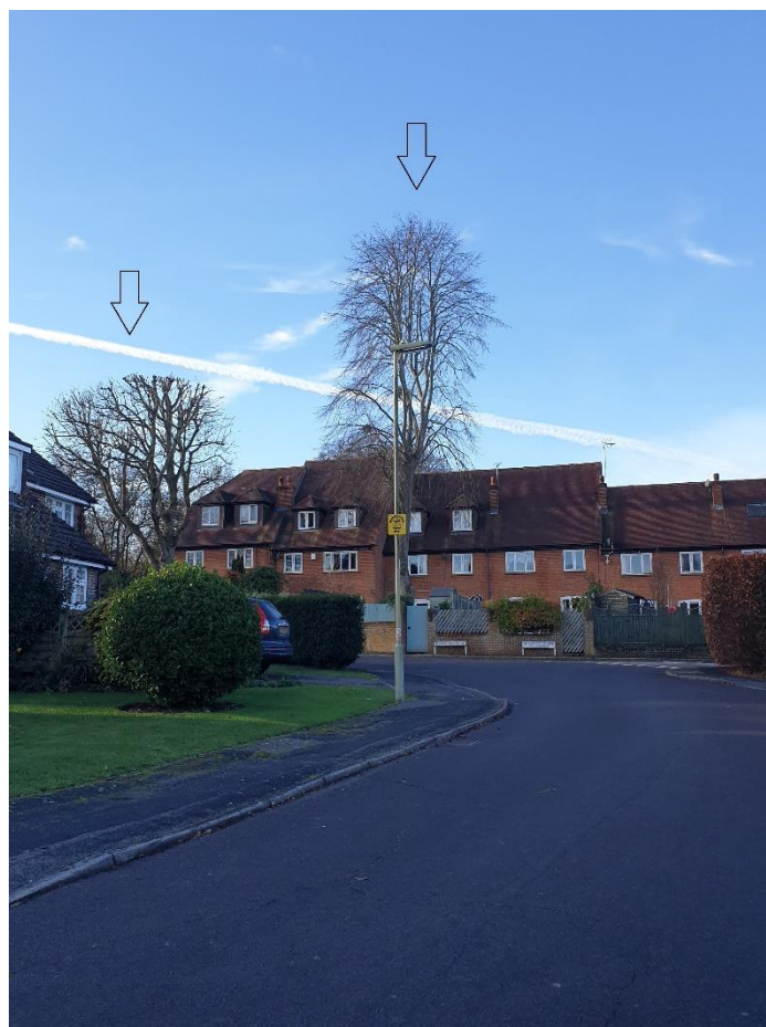
View from Reyntiens View, November 2020 (lime on right, chestnut on left)